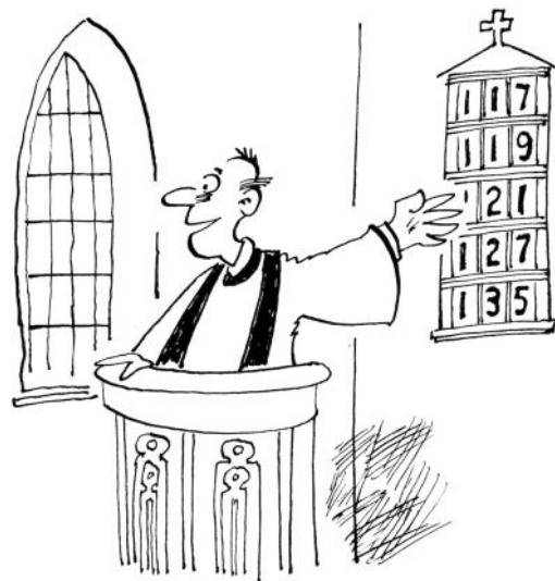
Today's hymns are based on last week's trend in petrol prices...

This week, why not make some time to do something together you both enjoy. It could be as simple as going for a walk, watching a movie together, or spending an evening in your local pub. Or of course you could do something adventurous – go para-gliding or bungee jumping! Or perhaps, you could just curl up together in front of a fire, and read stories to each other. Whatever it is, try and find something you can both take part in, and which will remind you of the fun times in your relationship!